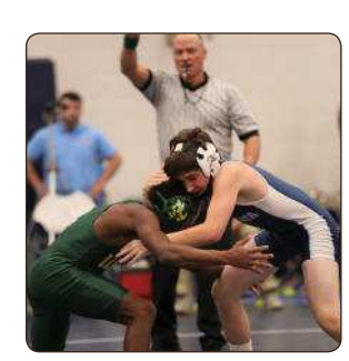
La Plata wrestling hosts dual tournament